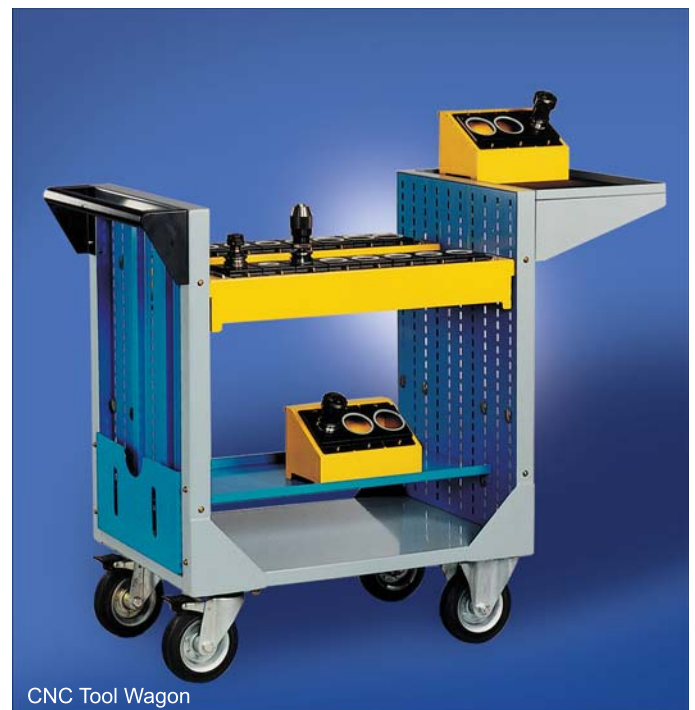
CNC Tool Wagon

The Company reserves the right to modify product specifications without prior notice and assumes no responsibility for any error which may appear in this publication.